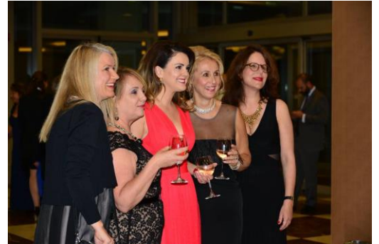
Our (non) Sleeping Beauty