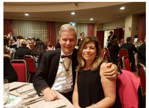
For more pictures have a look on our website