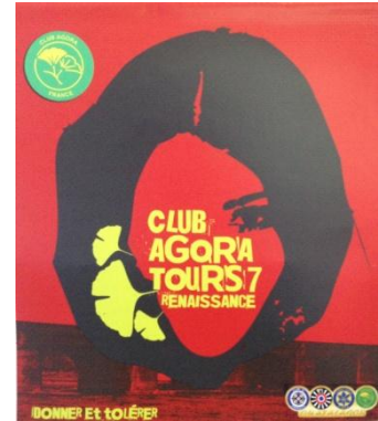
The very modern and hip banner