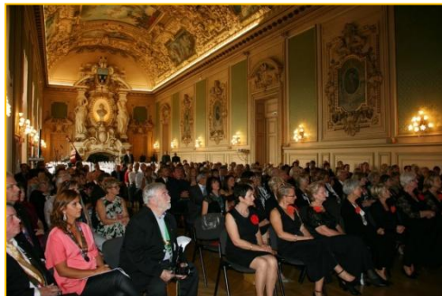
The impressive venue for the Charter