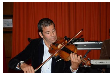
The violinist enchanted us by his talent.

Then the Gala Dinner was a continued explosion of friendship.