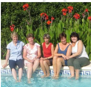
BM on Ibiza