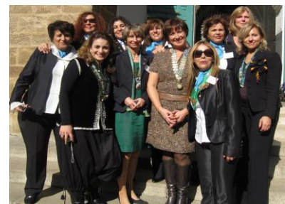
Together with Godmother Belgium