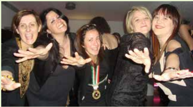
ITALIAN LADIES AT MTM IN CASCAIS