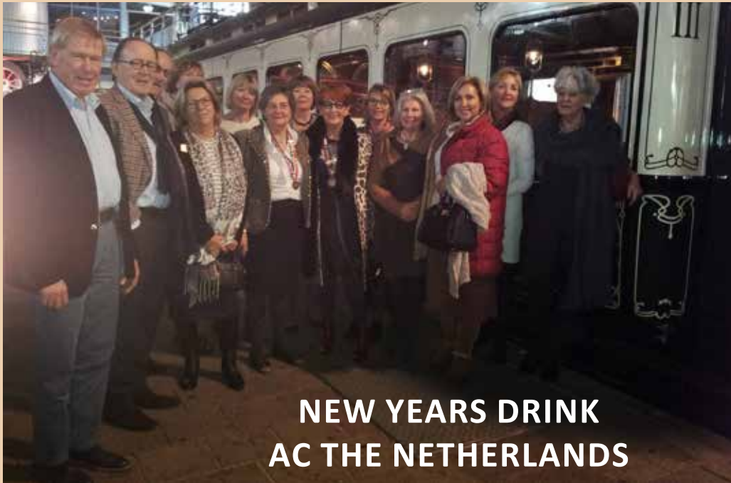
NEW YEARS DRINK AC THE NETHERLANDS