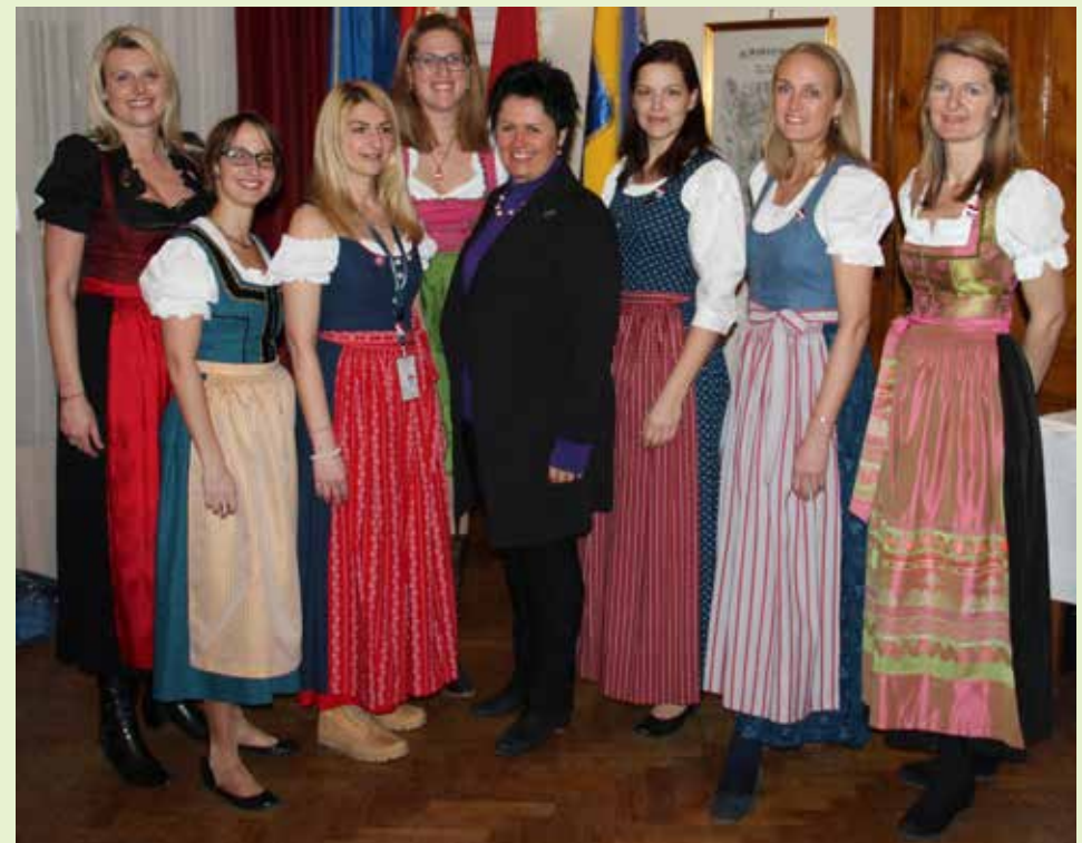
WELCOME BY LADIES FROM LC WIENER NEUSTADT