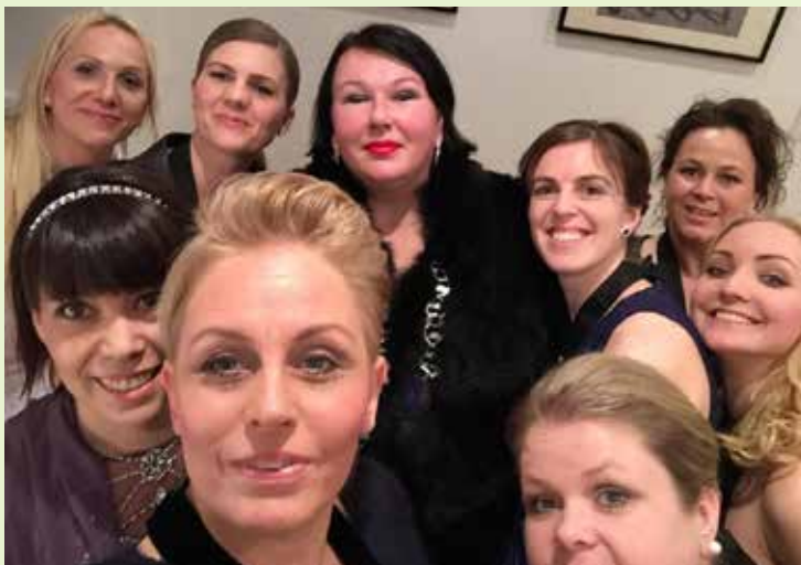
TONE WITH LADIES FROM LC NORWAY AT MTM IN COPENHAGEN