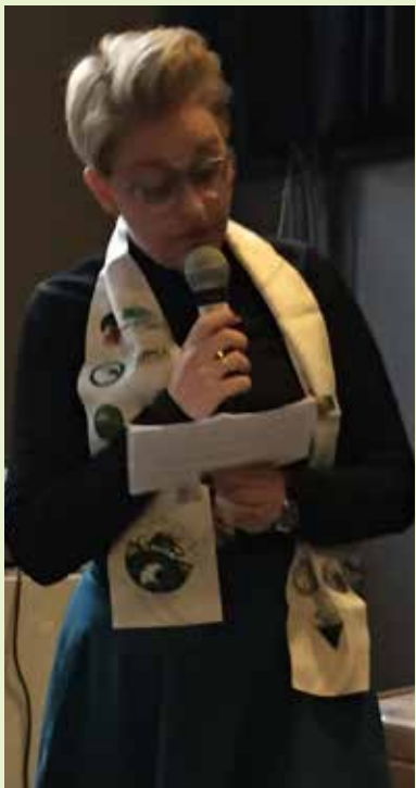
TONE GIVING SPEECH AT MTM LC IN COPENHAGEN