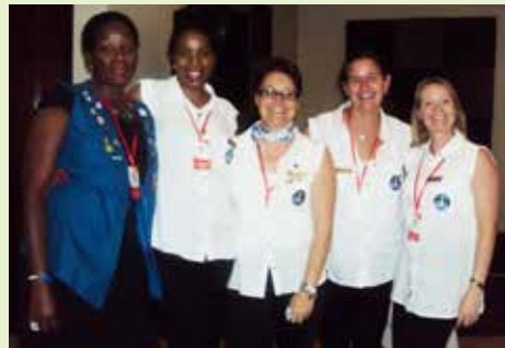
KGMOTSO AT MTM LC AFRICAN REGIONS