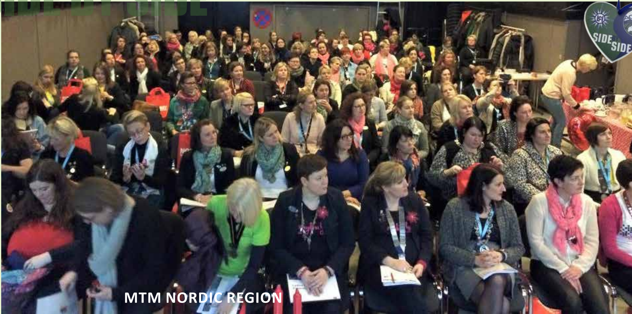
MTM NORDIC REGION