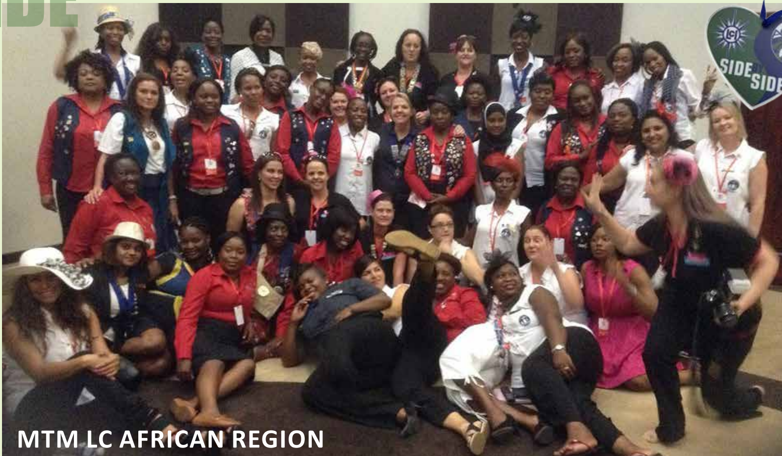
MTM LC AFRICAN REGION