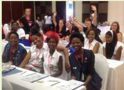
KGMOTSO AT MTM BOTSWANA