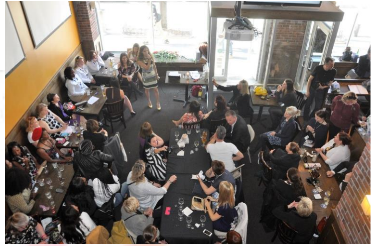
We filled the entire building from top to bottom