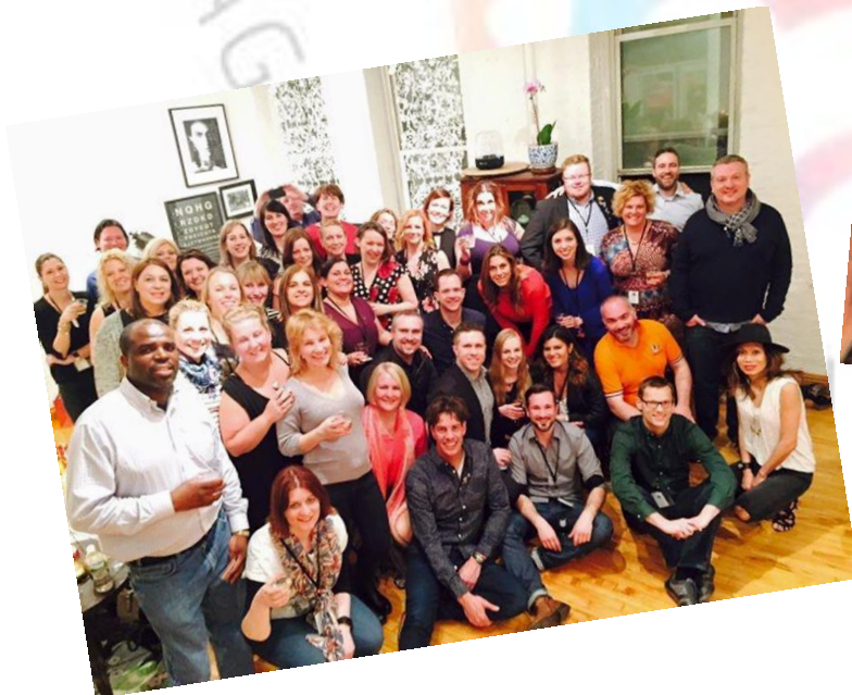
Blue Home Party at Eriks's