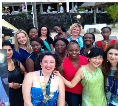
"Tolerance" of Agora Club