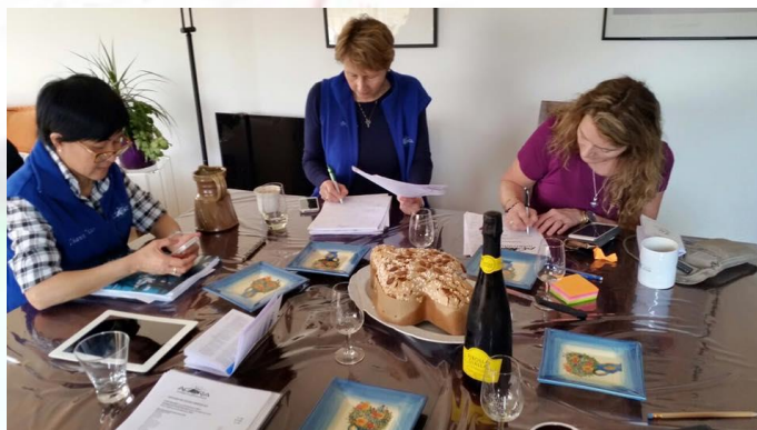
We were passionate about the Agora life and its spirit of "Service and Tolerance"

We had a look back on the past four months! We had done a lot to promote Agora Club, to strengthen the bonds with our brother and sister associations, to improve our communication. We worked out plans and programs for the future of Agora Club. We also discussed various aspects of Eyes For The World, and did some brainstorming on the Conference and the Celebration of the 20 th Anniversary.