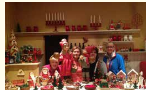
The lovely Christmas Garden