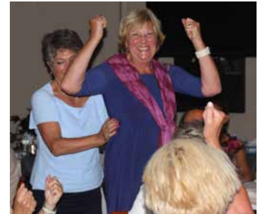
Golf AC Venlo