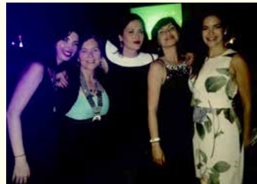
With Ladies Circle USA