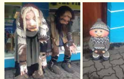
More shopping joined by small trolls and large trolls....