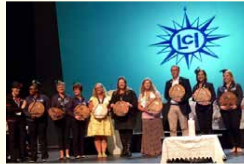
At the end of the official meeting the group of representatives of all organizations were asked on stage to receive a lovely gift from the South African ladies – a beautiful clock keeping time and encouraging all to venture to the next LCI conference in Cape Town! Now that will be a wonderful adventure!