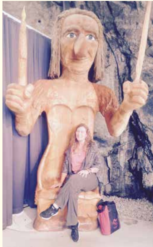
Found a comfy seat at a restaurant on our travels