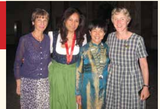
TC 154 MUNICH-GERMERING