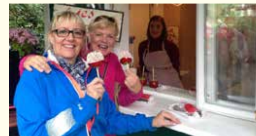
Enjoying a treat of candied apples