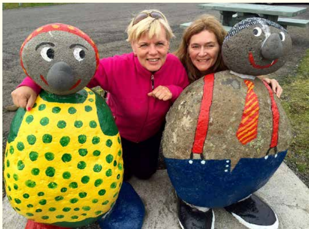
We found some trolls along the way!