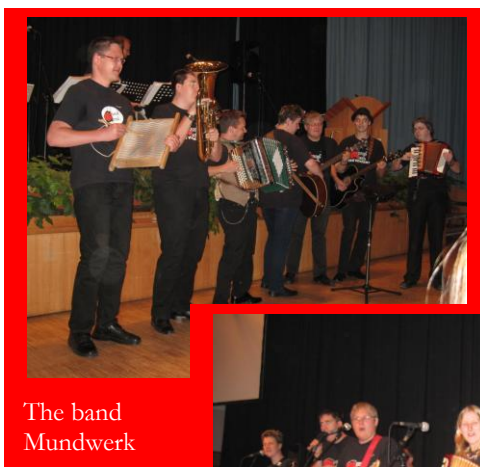
The band Mundwerk