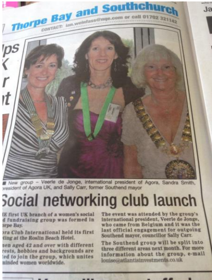
Article in local newspaper