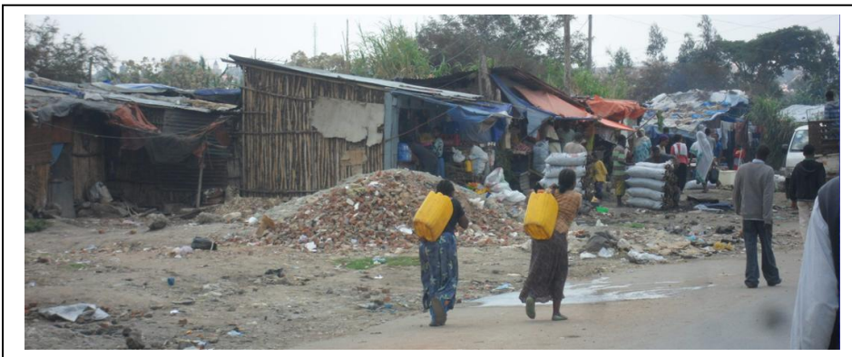
The way home.....?

Please remember: The deadline for your donations is the 15. of June!!