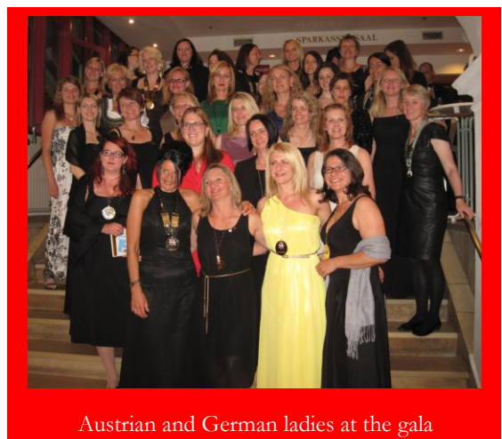
Austrian and German ladies at the gala

I travelled home with a feeling of warmth and friendship. Thank you very much LC Austria!!