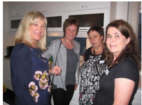
Our homeparty host with friends