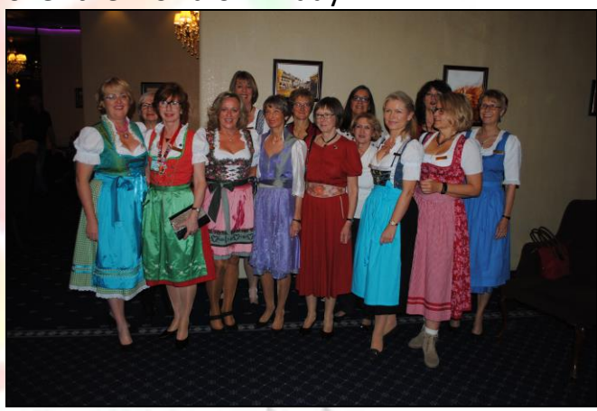
or the gala evening

Whether we are talking about the country specific evening with all the traditional costumes from all over the world on Friday