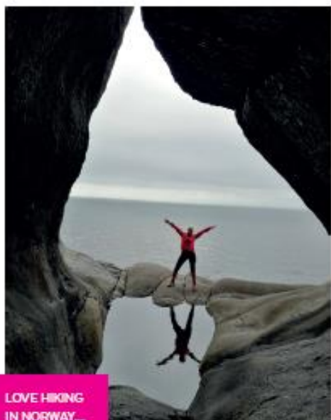
LOVE HIKING IN NORWAY...