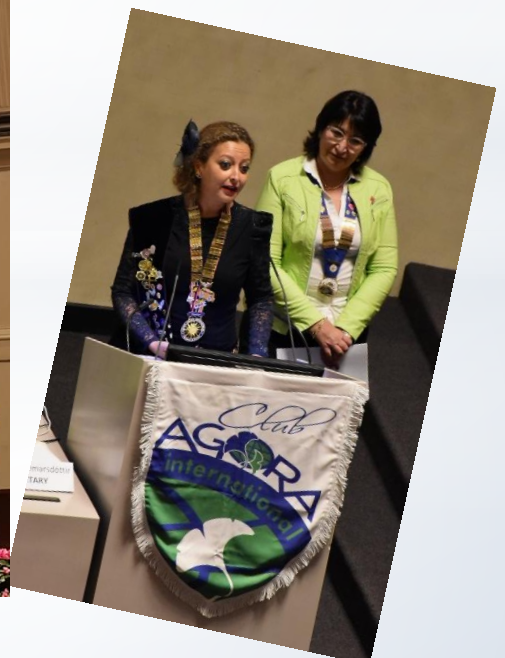
Calster 41 Club Int Treasurer 18-19.