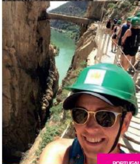
... PORTUGAL AND SPAIN