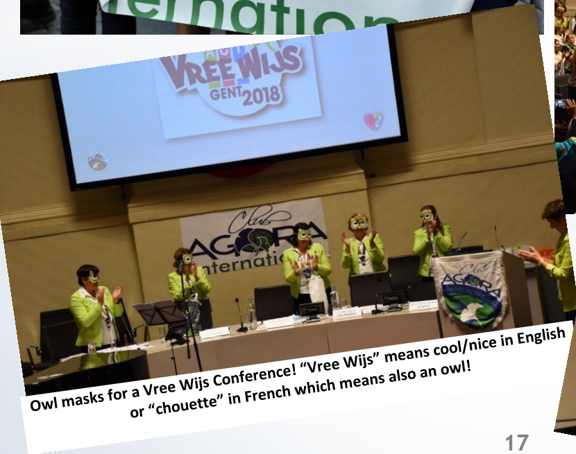
Owl masks for a Vree Wijs Conference! “Vree Wijs” means cool/nice in English or “chouette” in French which means also an owl!