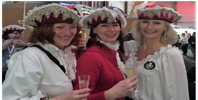
Board of Agora Club Tangent Germany

The „Pirate“-welcome party Friday evening was organized by French tablers in Guebwiller. The German lady- and tabler - pirates „boarded “busses to cross the boundary to France and to hijack the French Pirates. And I was one of them!