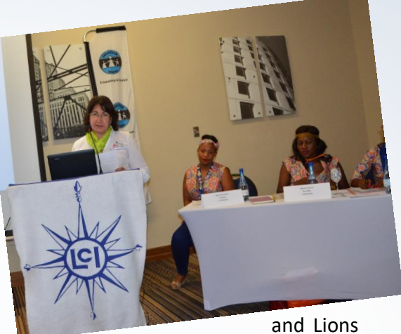
Round Table Family in their country but they really wanted to understand the success of Rotary Club and how they communicated worldwide.