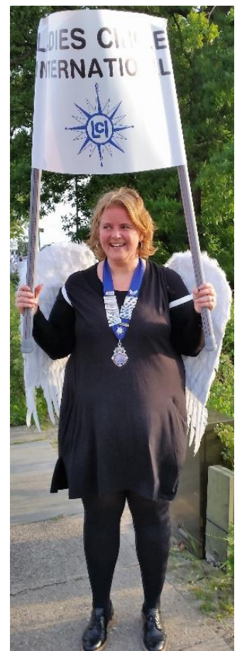
"Our Angel Heart" Gry, LCI-P 2016-17