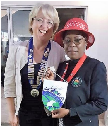
Then I proceeded to the Installation of the National Board of AC Zambia and handed out the Certificate!