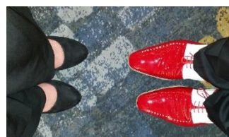
I love these shoes! The red ones!