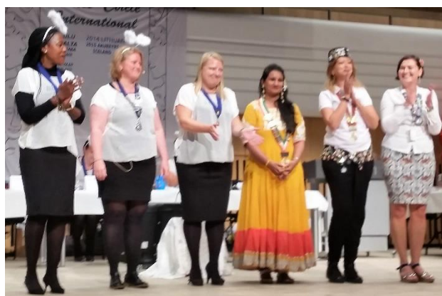
The new Board LCI-Board