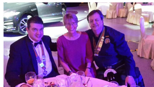
At the Gala together