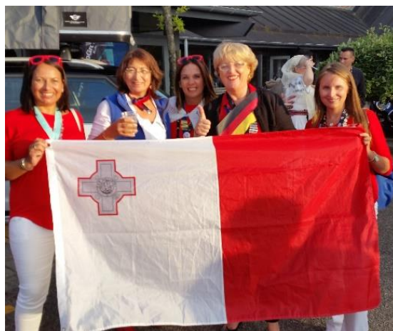
Ladies Circle Malta