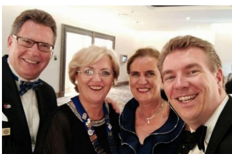
Some of my Finnish travel mates