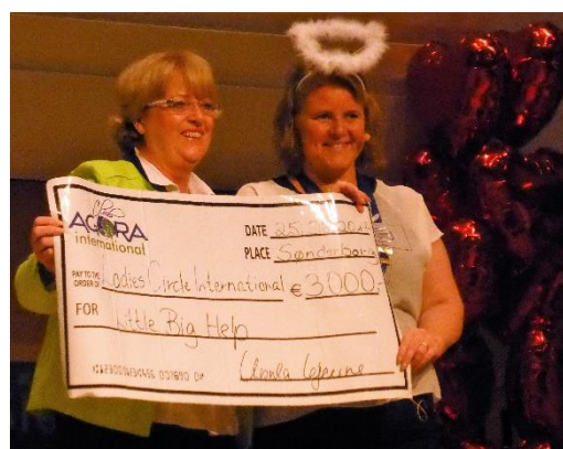
Check of 3.000 € for LittleBigHelp