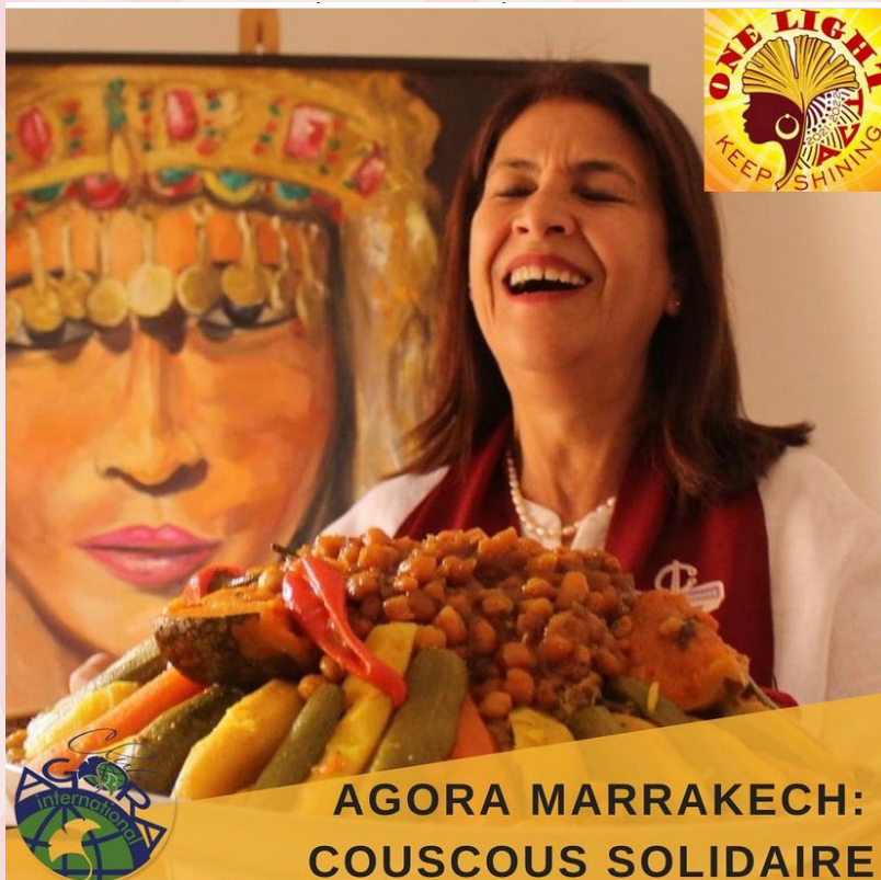
AGORA MARRAKECH: COUSCOUS SOLIDAIRE

Raising funds for the needy, whilst enjoying Traditional Moroccan meal.